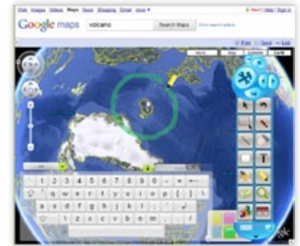
WizTech InFocus Edition software