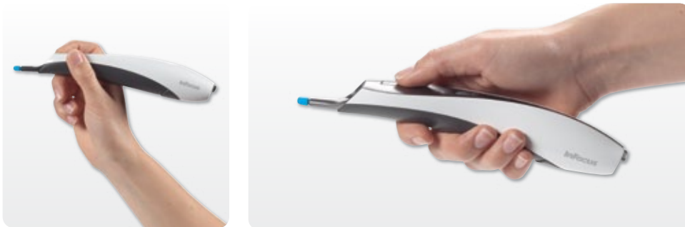
Hold the wand like a pen for drawing or writing, or hold it like a remote control – whichever is more comfortable.