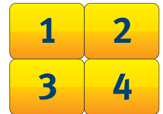
Moderator control panel