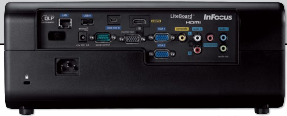
IN3916 Back Panel